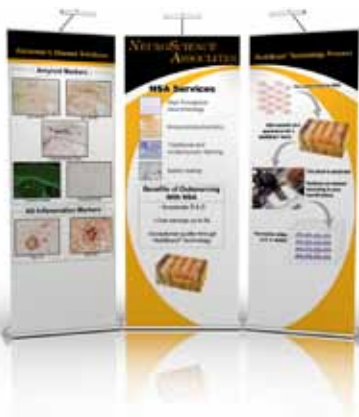
NeuroScience Associates designed their Endeavors with flexibility in mind.

that provide a general overview of the company and its services. They can either stand together as one display or be used to flank additional banner stands on either side. For example, NeuroScience Associates may insert a topic-specific banner stand in between the two end stands should such a show call for it.