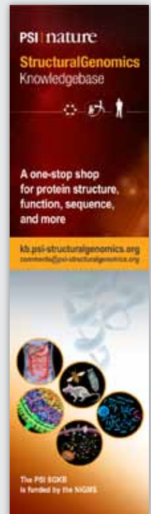
The PSI-Nature Structural Genomics Knowledgebase uses a Lonicera Banner Stand because the graphics are vibrant and colorful.

"We chose the Lonicera 24" with the TerraPro Graphic," she says. "I like its shape (tall but narrow, like a sail), portability with the nice case, and ease of assembly. Once assembled, it's extremely lightweight and easy to maneuver, but the overall presentation is amazing with the brilliant colors and additional spotlight that makes the graphics stand out. This banner is eye-catching and draws people in."