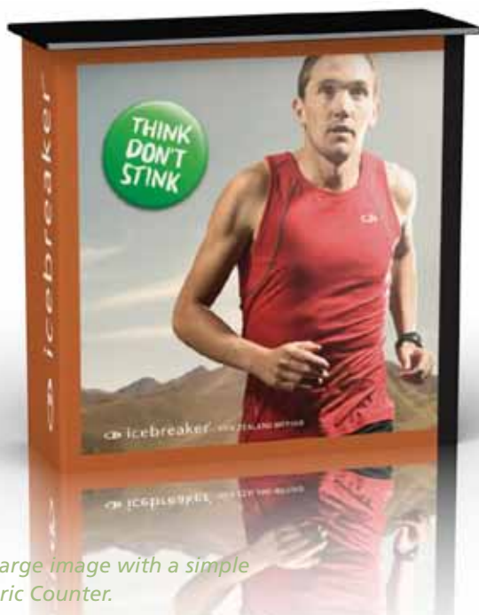
ICEBREAKER used a large image with a simple tag line for their Fabric Counter.