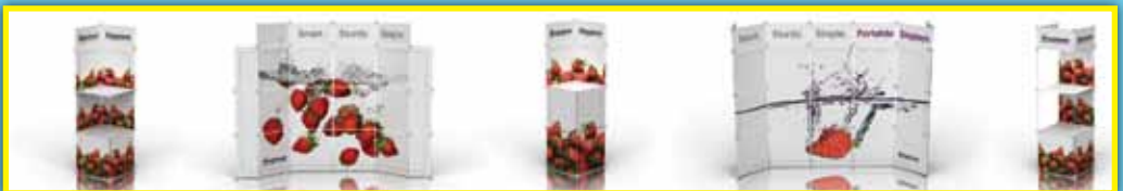
The limitless variations of the Protia display.